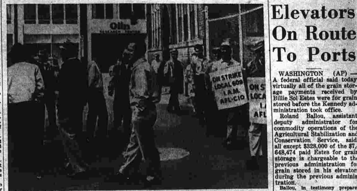
About 3,000 production workers went on strike today at Winchester-Western Division of Olin Matheson Chemical Corp. and promptly set up picket lines. The company, which is New Haven's largest employer, manufactures weapons, ammunition and other products. Principal issue in strike is believed to be wages.